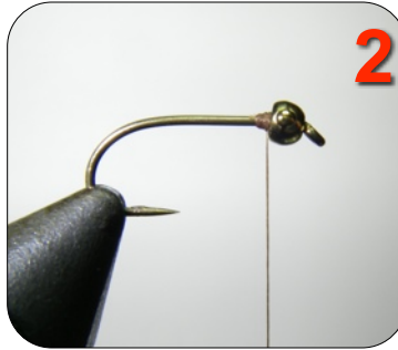
2 Start your thread behind the Nymph Head bead.