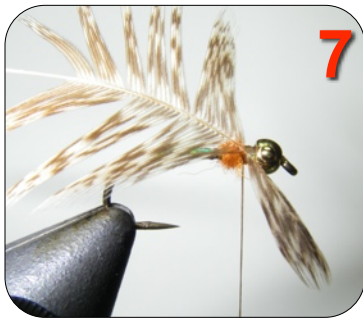
7 Now tie on your Whiting's Brahma hen feather and cut the tag end off and wrap the feather forward and tie and cut the tag and whip finish.