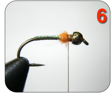
6 Dub a small amount of super fine dubbing leaving room to tie in the legs.