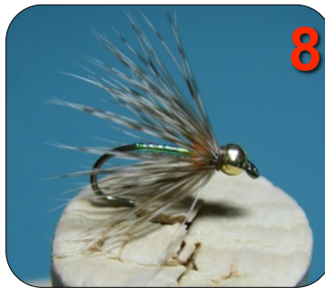
8 The Sparkle Spider makes a great attractor fly.