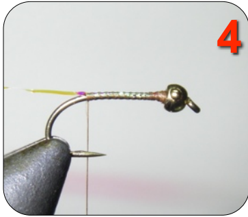
4 Wrap your thread just to barb and back to just behind the head.