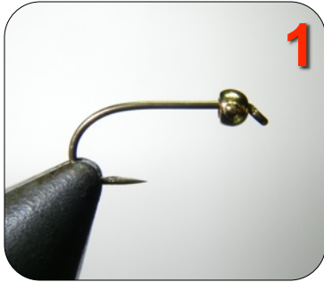
1 Catch your hook in the vise with a Nymph- Head Bead.